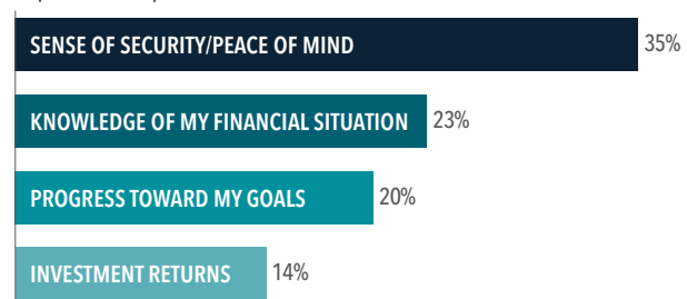
Top Four Responses

Source: Dimensional Fund Advisors. In 2017, the firm surveyed almost 19,000 investors globally to help advisors who work with Dimensional better understand what is important to their clients.